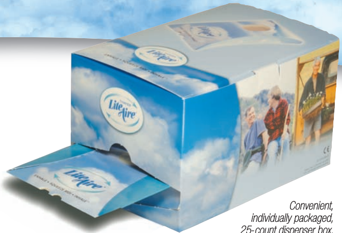
Convenient, individually packaged, 25-count dispenser box.