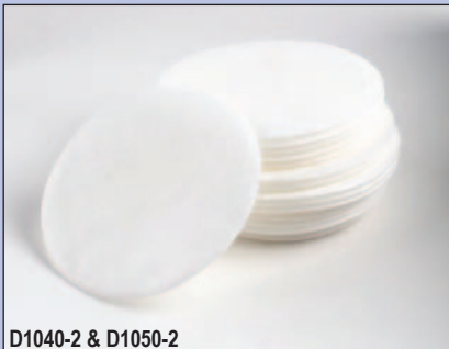
D1040-2 & D1050-2 D1040-2 Disk, Flowmate 2500 BTVR Filter*** D1050-2 Disk, LTE BTVR Filter***