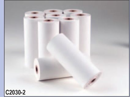
C2030-2 Paper, Flowmate/Flowmate V Plus Printer