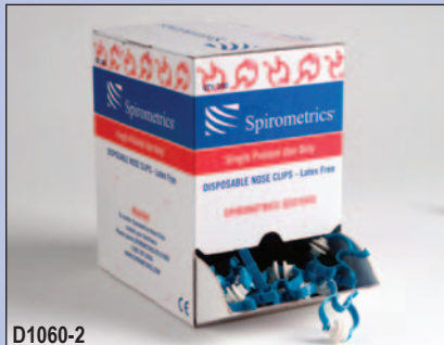
D1060-2 Nose Clip, Disposable***