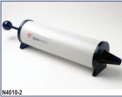
N4010-2 3 Liter Calibration Syringe