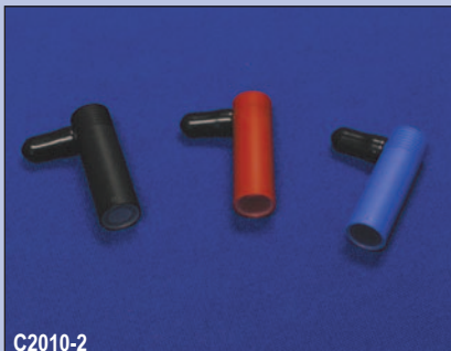
C2010-2 Ultra Performance Pens Kit, 5 Ea. Black, Blue, Red Direct Replacement For: Item# 171 A-M Systems. Fits Collins. Fits Puritan-Bennett Model# VS400.