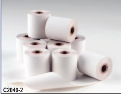
C2040-2 Paper, CMD/CO Printer