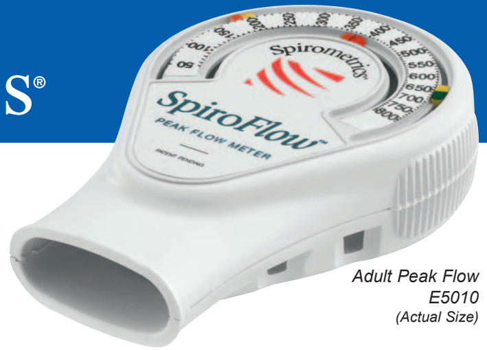
Adult Peak Flow E5010 (Actual Size)