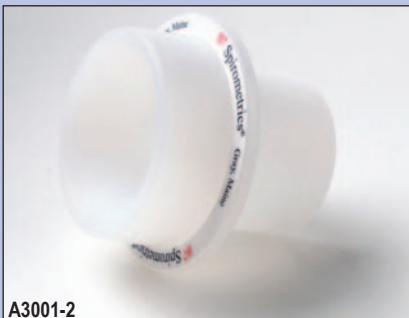
A3001-2 Adapter, SpiroFilter-Variou sizes available; Please call for correct part number