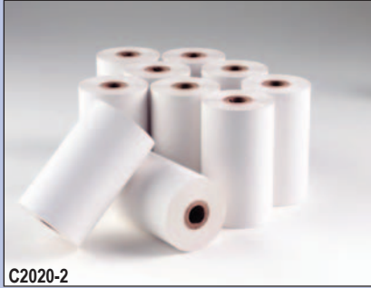
C2020-2 Paper, SMI III Printer