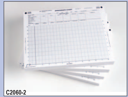
C2060-2 Charts for SMI I, SMI III (2453, 2451)*** Direct Replacement For: Item# 1308 A-M Systems