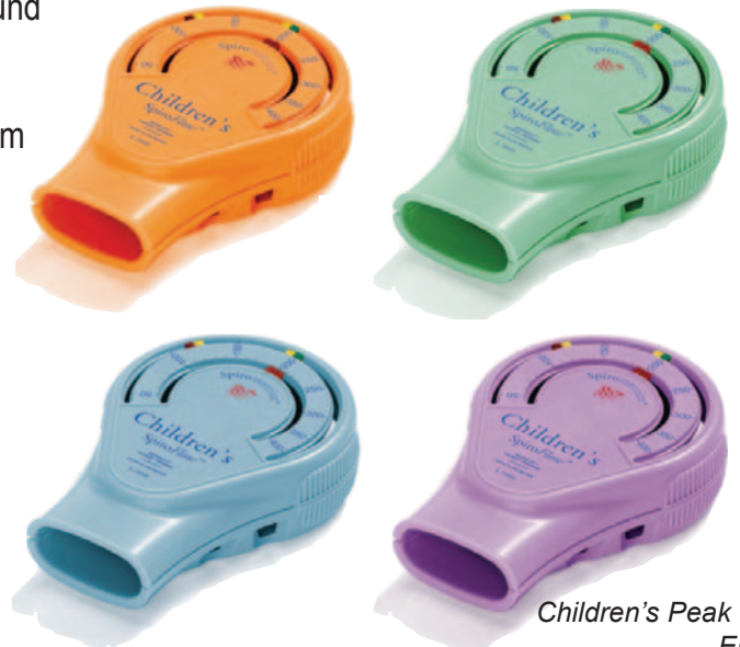
Children's Peak Flow E5020