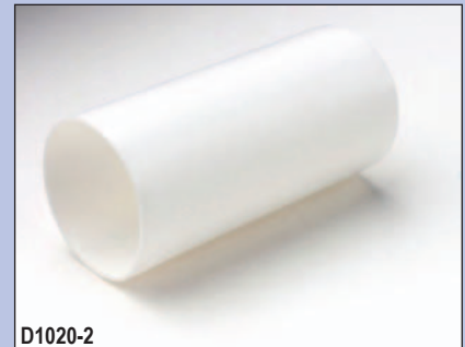
D1020-2 Mouthpiece, Adult *** Various options for quantities