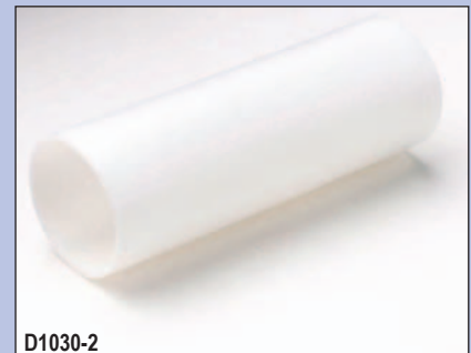
D1030-2 Mouthpiece, Pediatric*** Various options for quantities

NOTICE: To assure accurate spirometry results on your equipment ATS recommends routine preventive maintenance for spirometers and calibration syringes. Spirometrics recommends: Recertification and recalibration for accuracy and liability concerns on a yearly basis. Call 800-767-0004 to schedule your equipment for this routine maintenance.