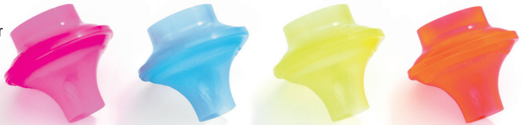
Pulmonary Filters D1010-2

Over 20 Years Experience Producing Quality and Affordable Respiratory and Pulmonary Products